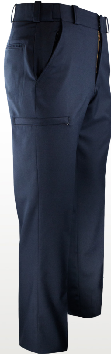
INTERNAL EIGHT POCKET