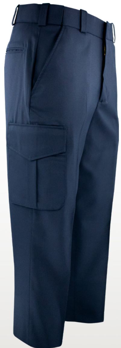
EXTERNAL EIGHT POCKET