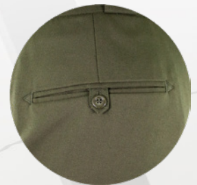
Button sealed pocket