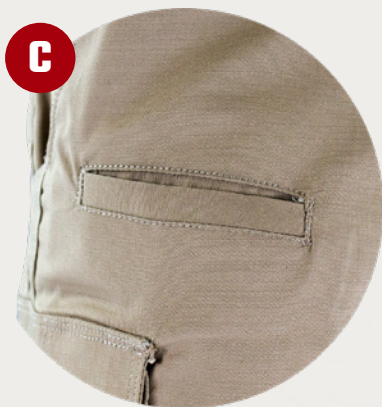
Two 4" Front Welt Pockets