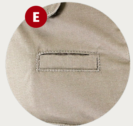
Two Rear Utility Pocket