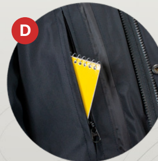
D Dual Internal Patch Pocket w/wire access