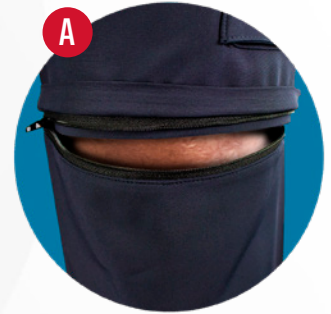
Zip-off legs converts into shorts