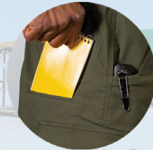
Two 8" Deep Utility/ Flashlight Pockets