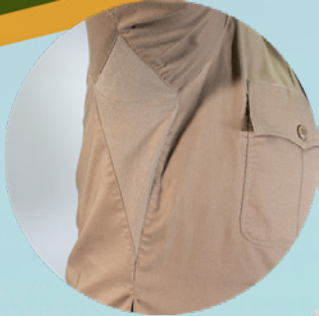
Gusseted Diamond Mesh Underarms for Motion and Airflow