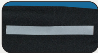
1/2" Reflective Trim under Collar Back