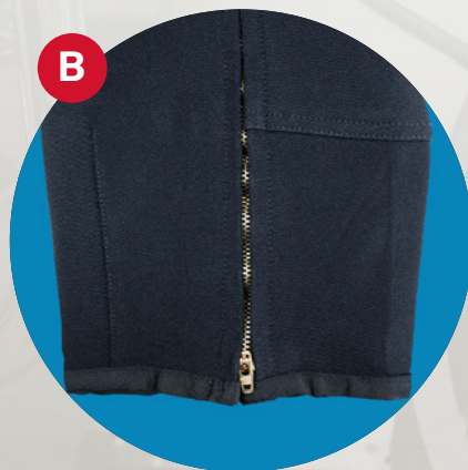
10" Zippered Leg Gussets