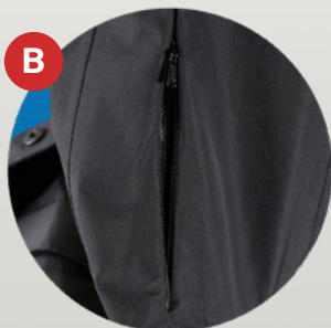
B Dual Underarm Venting w/Zippers