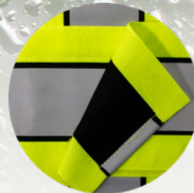
Hook + Loop Waistband