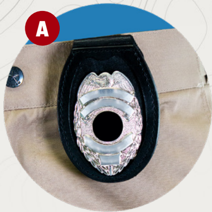
Badge holder tab