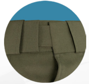
Self-adjusting action waist