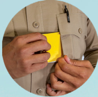
Two-Front Pockets w/Hidden Document Pockets