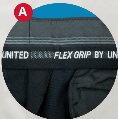
2" Flexgrip™ waistband with Ban-Roll