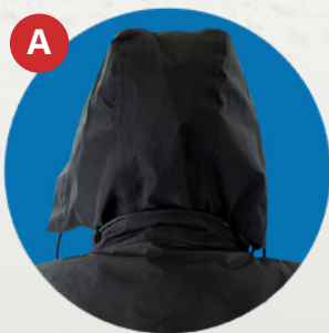
A Three piece Waterproof Hood w/Drawcord