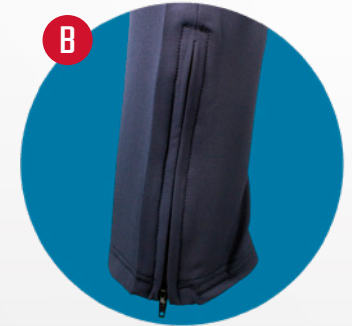
10" Zippered Leg Gussets