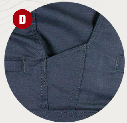
Reinforced Pocket Knife Corners