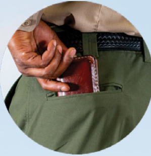
Two Welt back Pockets