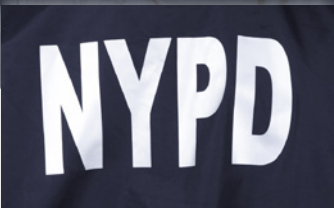
LETTERING ON THE BACK