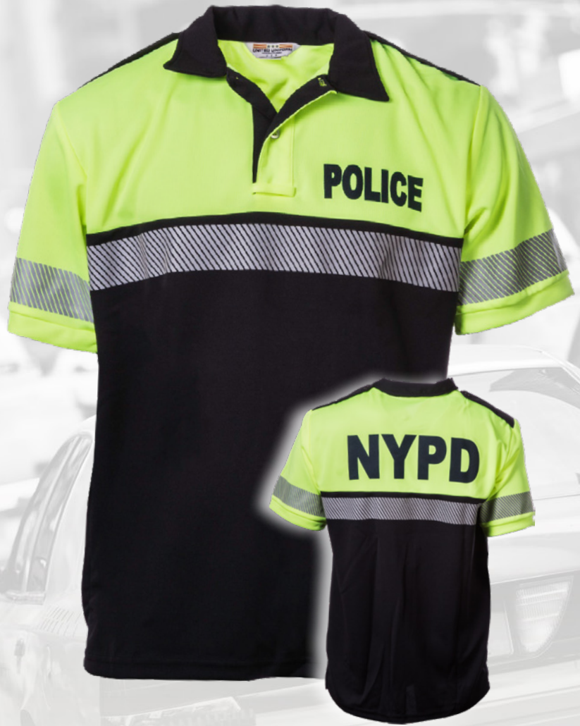
*Back of Shirt