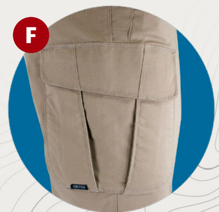
Innovative Cargo Pocket Design