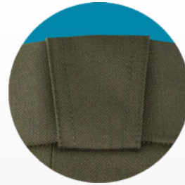
Keystone belt loops