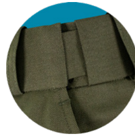
Self-adjusting action waist