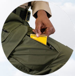
Pleated Cargo Pockets w/Zippered Cell and Map Pockets