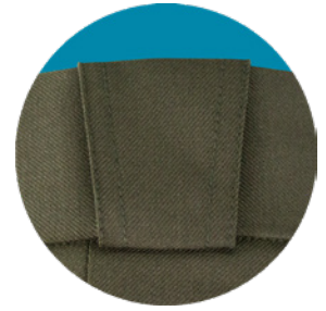
Keystone belt loops