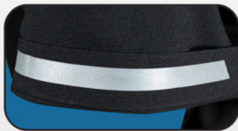
1/2" Reflective Trim under Sleeve hem